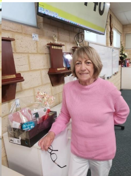
The two lucky Jennies with their prizes on the day.